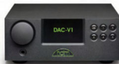
NAIM DAC-V1 Asynchronous USB DAC/Digital Preamp $2,595