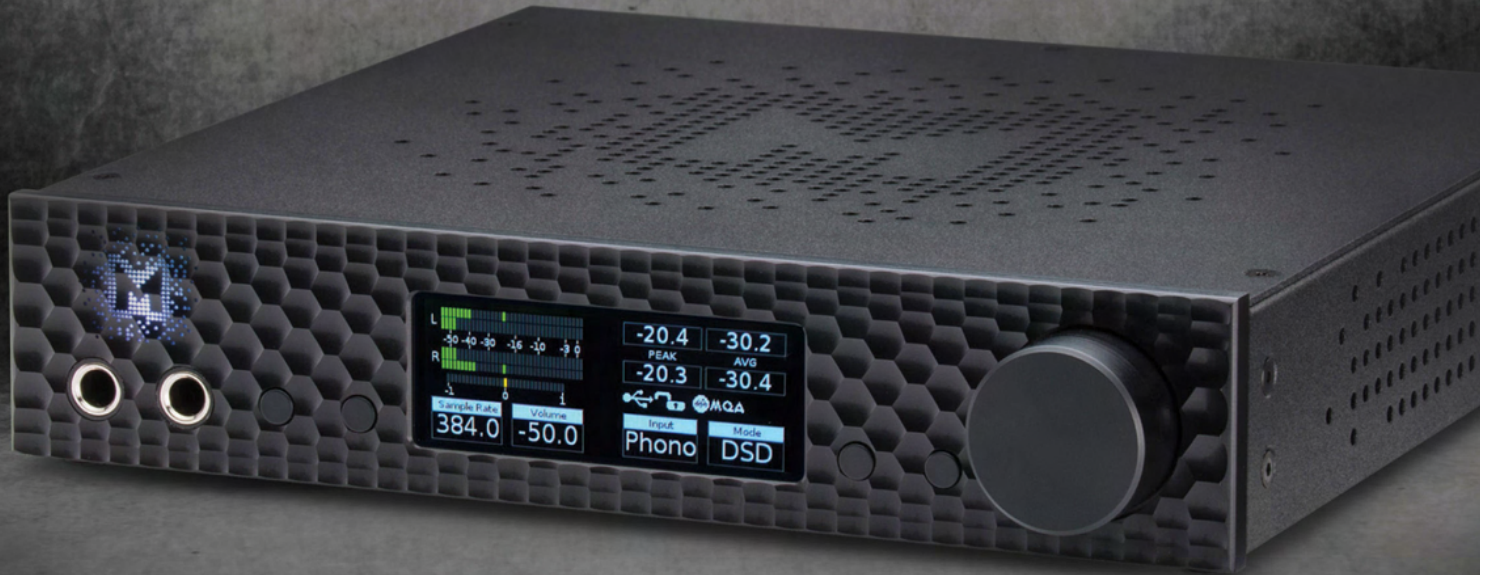
MYTEK Brooklyn MQA DSD DAC/ Headphone Amplifier $1,995