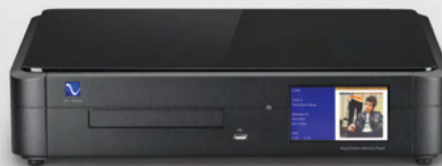
PS AUDIO DirectStream Memory Player CD/SACD Transport $5,999