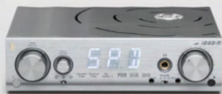
iFi Pro iDSD DAC $1,999