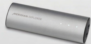
MERIDIAN Explorer2 MQA DAC $299